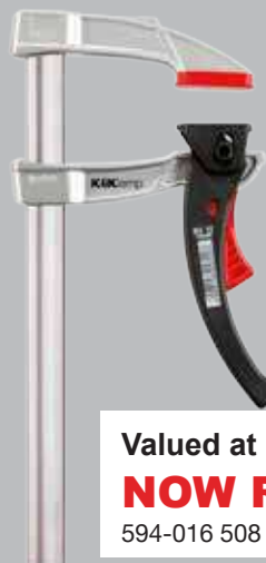
CLAMP 160x80 (KLI16) KLIKlamp