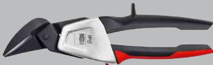
SNIPS D39ASS LOW FATIGUE CONT CUT

Valued at R 1 615,04 NOW R 1 033,62 578-039 110 Excl. VAT