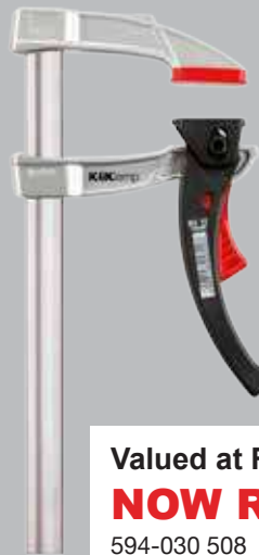
CLAMP 300x80 (KLI30) KLIKlamp