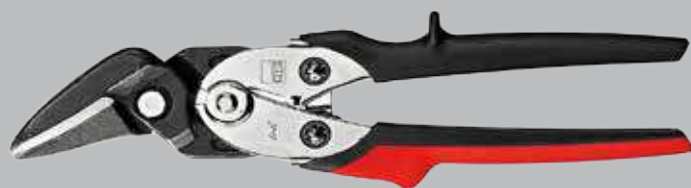
SNIPS D15AL ALL-ROUND ERGO HANDLE

Valued at R 567,62 NOW R 363,28 578-015 210 Excl. VAT