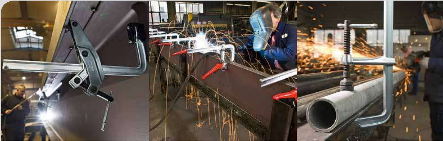
CLAMP 400x80 (KLI40) KLIKlamp