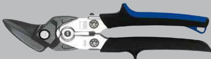
SNIPS D27A COMPOUND LEVERAGE

Valued at R 1 108,14 NOW R 709,21 578-027 110 Excl. VAT